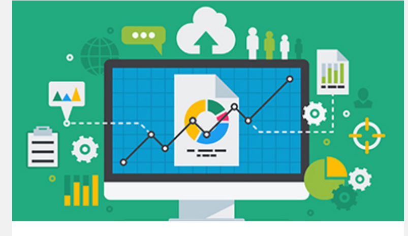
Table Driven Trigger Management Framework