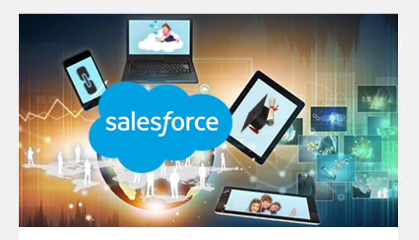
Salesforce Advisor Link, a Pillar in Student Management System

Universities/Institutes also realized that creating a great